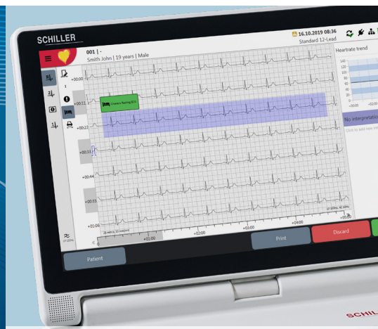
Create a 10 seconds resting ECG from a resting rhythm recording of up to 20 minutes with ECG Framer