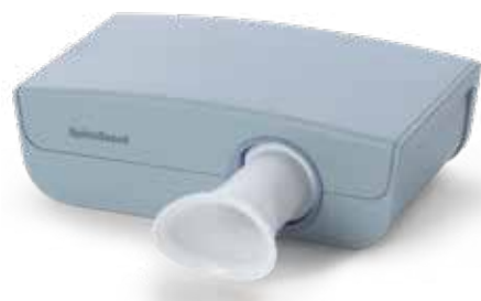
Ultrasound spirometer SpiroScout SP plus

The spirometry option offers FVC, SVC and MVV with a large selection of reference standards, pre and post tests, as well as interpretation of the FVC results. The device provides feedback on the procedure's quality during the test and after each trial. An incentive screen is included for trials with children.